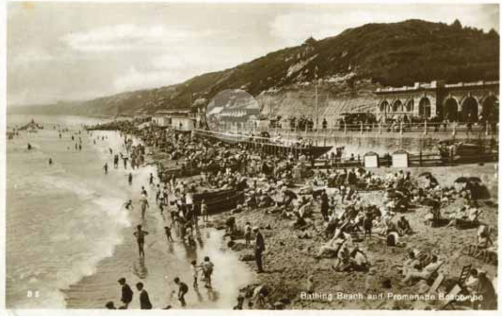
The site - 1930's