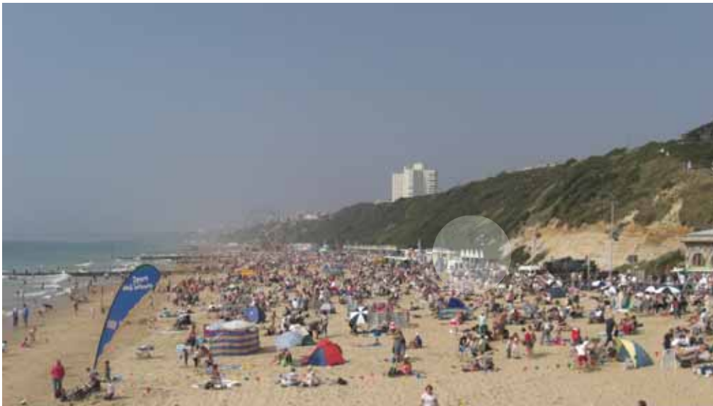
The site - August 2008