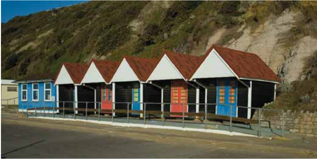
The site today - blue portacabin and 5 beach huts to be replaced with 4 new accessible huts.