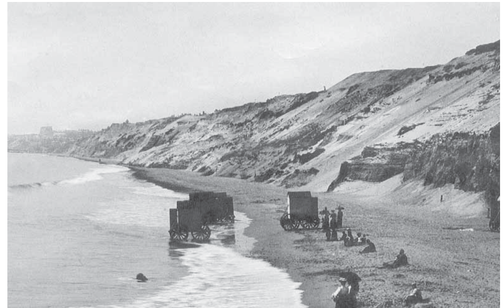
The site - c.1900

Every seaside town has its own interpretation of the beach hut, a local vernacular evolved from nineteenth-century wheeled bathing machines. The Bournemouth beach hut has remained unchanged since Borough Engineer F. P. Dolamore laid down design rules around 1909.