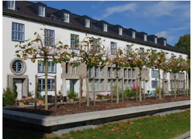
Civilian conversion: the former US military headquarters in Zehlendorf, 2017.

The metropolitan region possesses an exceptional stock of housing. reflecting very different housing policies and built under private. municipal, and state-directed regimes. In the decades between the unification of Germany in 1871 and the First World War - and especially between the 1890s and 1910s - private-sector development formed Greater Berlin's characteristic housing landscape: The socially and functionally diverse inner city with its dense population was notorious for the run-down tenements which in recent years have become highly desirable real estate. Developers created homogeneous middle-class neighbourhoods, and garden suburbs sprang up on the city's periphery. The founding of Greater Berlin put housing policy and construction on a new footing. After 1920, a second layer was superimposed over the sharp social differentiations of pre-1914 Berlin when a unique period of municipal and state-run housing construction generated a parallel housing landscape of great social complexity. The result was a range of different housing forms, marked by a clear contrast between inner and outer city. The challenge today is to use Berlin's rich urban history as a basis for developing a housing policy that counteracts socio-spatial segregation, reaches beyond the city's administrative boundaries, and is committed to good urban design.