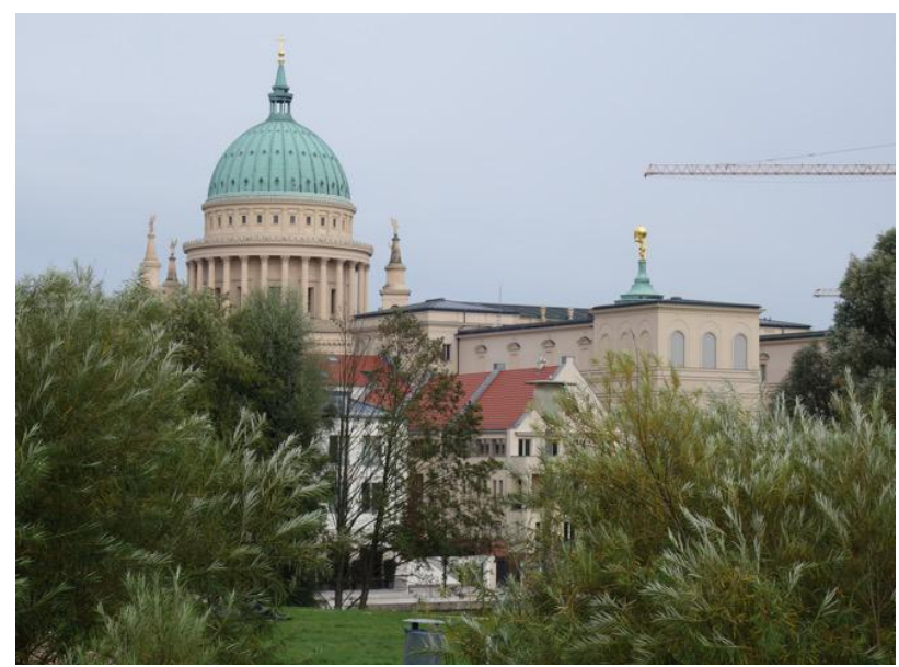
Potsdam's new centre, 2013.