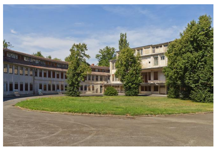
The Nazi-era Olympic Village, later used by the German army under Hitler and the Soviet Red Army during the Cold War; today a development zone for housing (Wustermark).