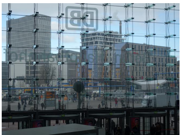
The new central railway station: urban development powerhouse, 2019.