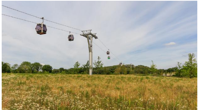
International Garden Festival site in Marzahn-Hellersdorf, 2017.

The region is rich in green space and water. This was in part a result of political decisions, above all the famous forestry agreement of 1915. As one of the most important achievements of the joint administrative body founded in 1912, the deal reserved huge swathes of forest for recreation. Today there are still large expanses of woodland in south-west, northwest, and south-east Berlin, in some places enriched by wonderful lake landscapes. The founding of Greater Berlin also spurred the establishment of numerous public parks serving recreation, culture, and sport. The construction of the Olympic stadium under the Nazis provided the city with a huge sports complex. In the years before reunification, a much-admired culture of caring for historical parks emerged in West Berlin, another unique feature of the city. After the fall of the Berlin Wall, large new parks were created within the city and regional parks planned outside it. This development was crowned with the International Garden Festival in 2017. Internationally the metropolitan region is widely known for the existing, highly significant network of parks which were meticulously reconstructed after reunification and form part of the historic palaces and parks of Potsdam and Berlin. At the same time, however, urban green space below the World Cultural Heritage scale has no major lobby and the need for it must be regularly reasserted.